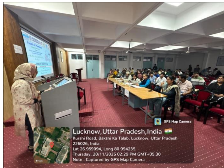
Students Participating in Debate Competition