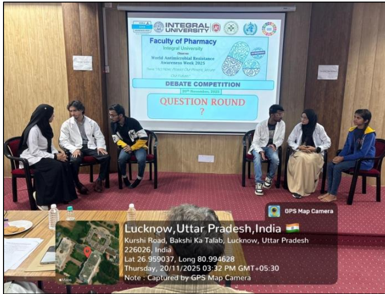
Students Participating in Debate Competition